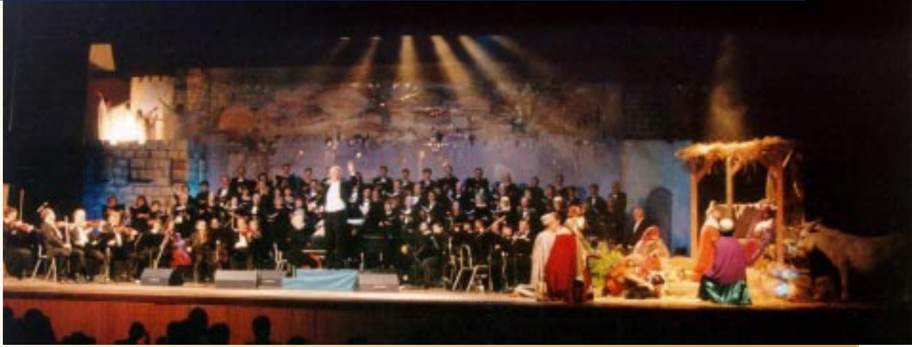
A presentation of the Nativity Scene with the actors, animals, angels, oratorio choir and orchestra.

One of the most anointed and timely events that the Christian Embassy has ever sponsored was the three concerts over the past Christmas weekend in the big auditorium of the International Convention Centre in Jerusalem.