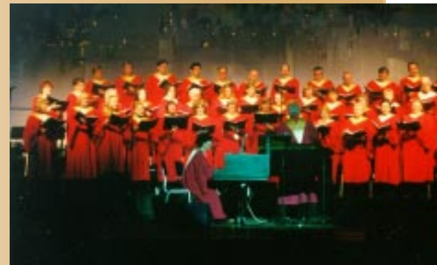
Smoke Rise Community Church Choir

The whole production was extremely professional and there was a powerful anointing that touched the many Christians and Israelis present, amongst whom were hundreds