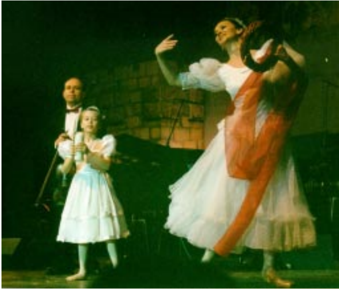
The Popov family on stage