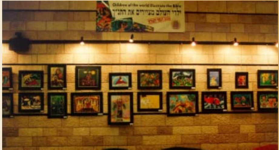
A few of the 250 paintings on exhibition in the foyer of the Jerusalem Theatre

Two hundred and fifty of the more than one thousand paintings submitted, were hung in the foyer of the Jerusalem Theatre and are a wonderful expression of creativity and Bible knowledge by children. The judges were astounded and thrilled to see the tremendous technical skills and creative ideas submitted. Subjects covered almost the whole Bible, from Old Testament creation scenes, to the New Jerusalem, as depicted in the New Testament.